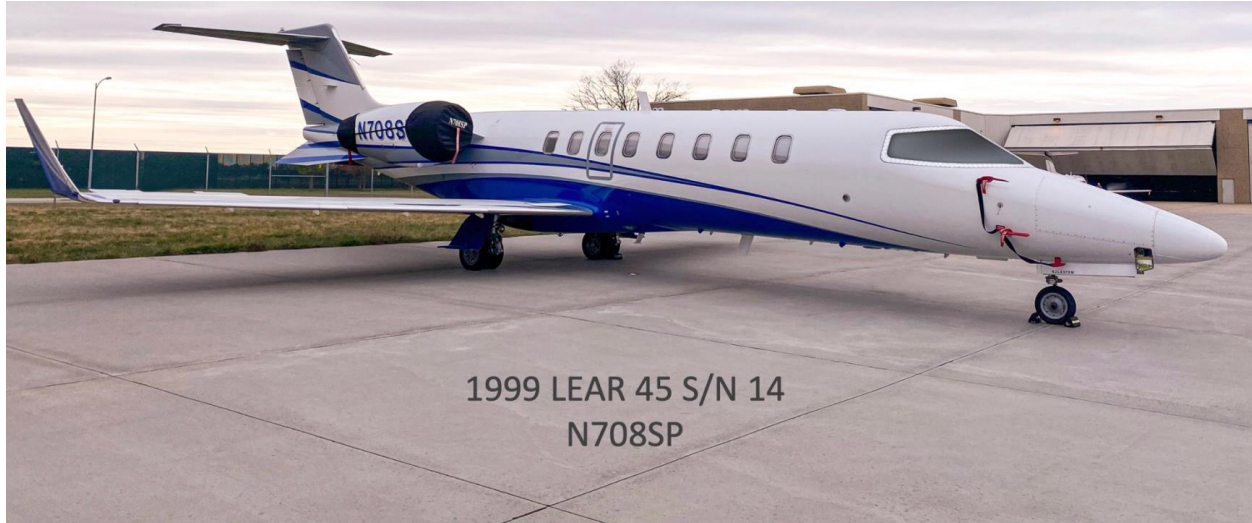
1999 LEAR 45 S/N 14 N708SP