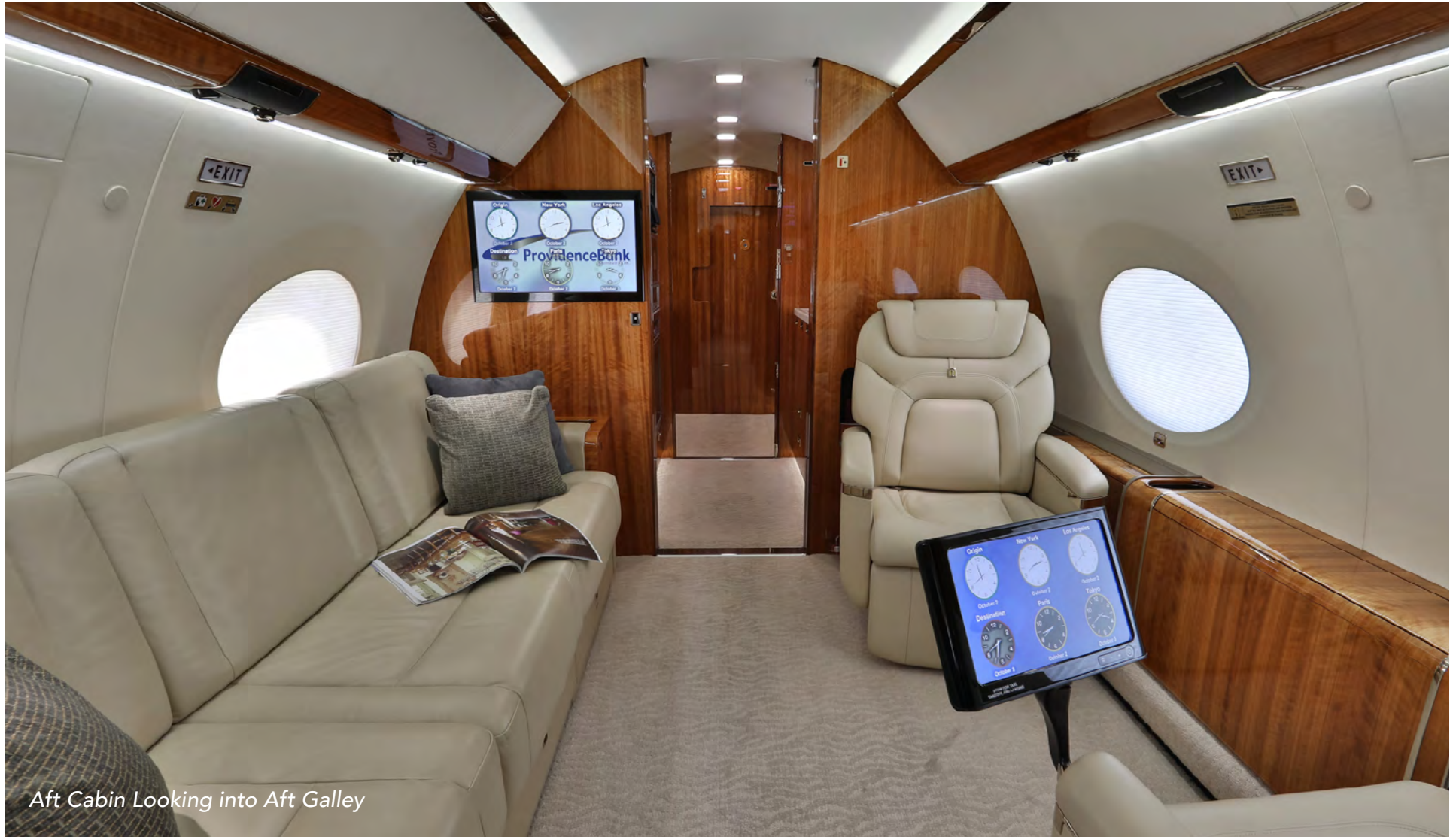
Aft Cabin Looking into Aft Galley

Specifications and/or descriptions are provided as introductory information only and do not constitute representations or warranties. Verification of specifications remain the sole responsibility of purchaser. Aircraft is subject to prior sale, lease, and/or removal from the market without prior notice. SPECIFICATIONS AS OF SEPTEMBER 10, 2021.