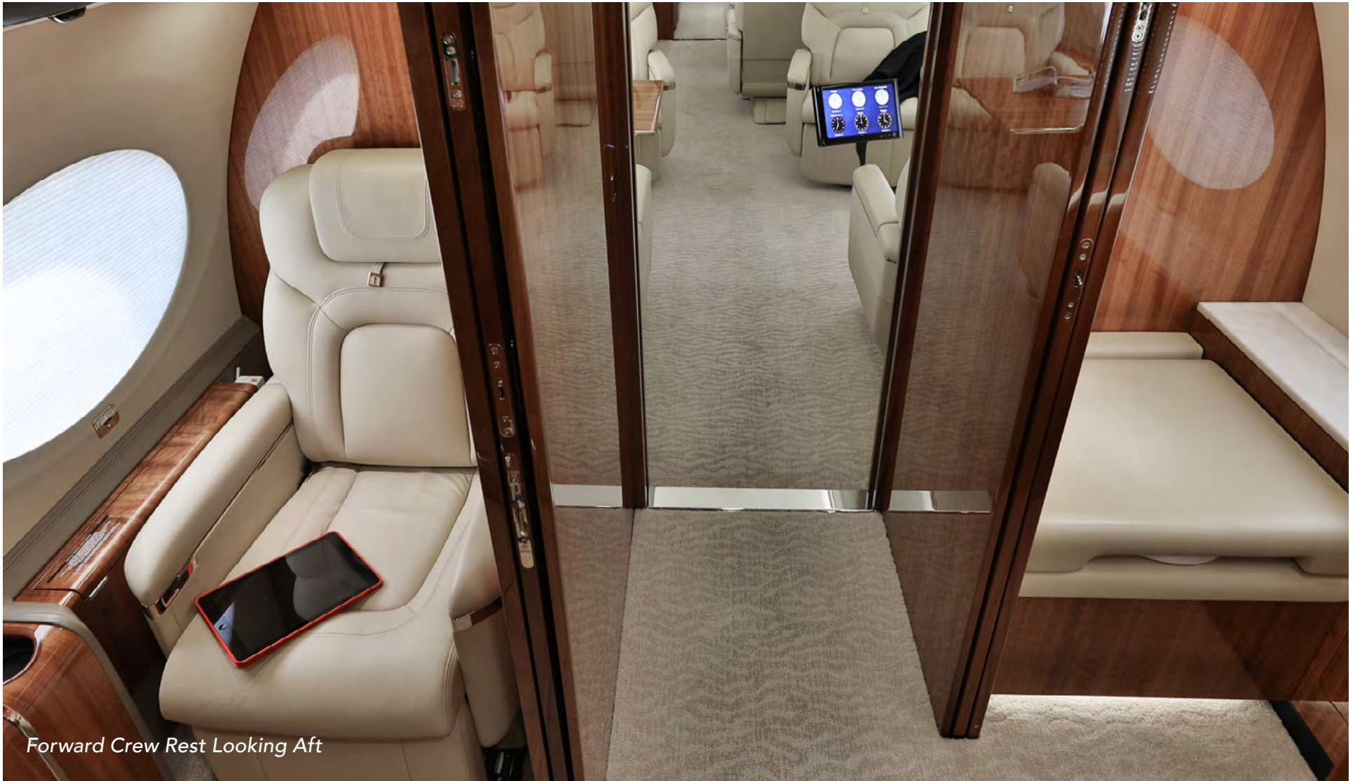
Forward Crew Rest Looking Aft

Specifications and/or descriptions are provided as introductory information only and do not constitute representations or warranties. Verification of specifications remain the sole responsibility of purchaser. Aircraft is subject to prior sale, lease, and/or removal from the market without prior notice. SPECIFICATIONS AS OF SEPTEMBER 10, 2021.