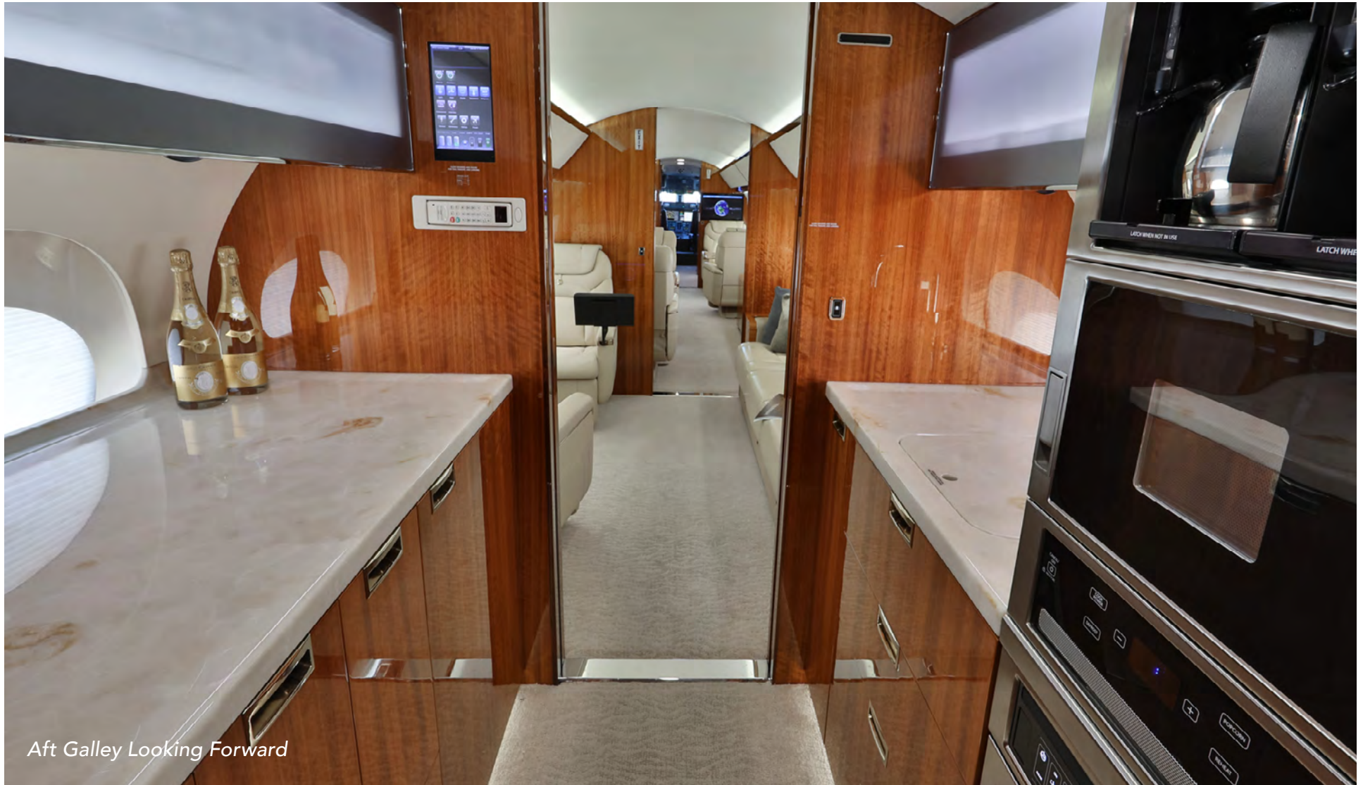
Aft Galley Looking Forward

Specifications and/or descriptions are provided as introductory information only and do not constitute representations or warranties. Verification of specifications remain the sole responsibility of purchaser. Aircraft is subject to prior sale, lease, and/or removal from the market without prior notice. SPECIFICATIONS AS OF SEPTEMBER 10, 2021.