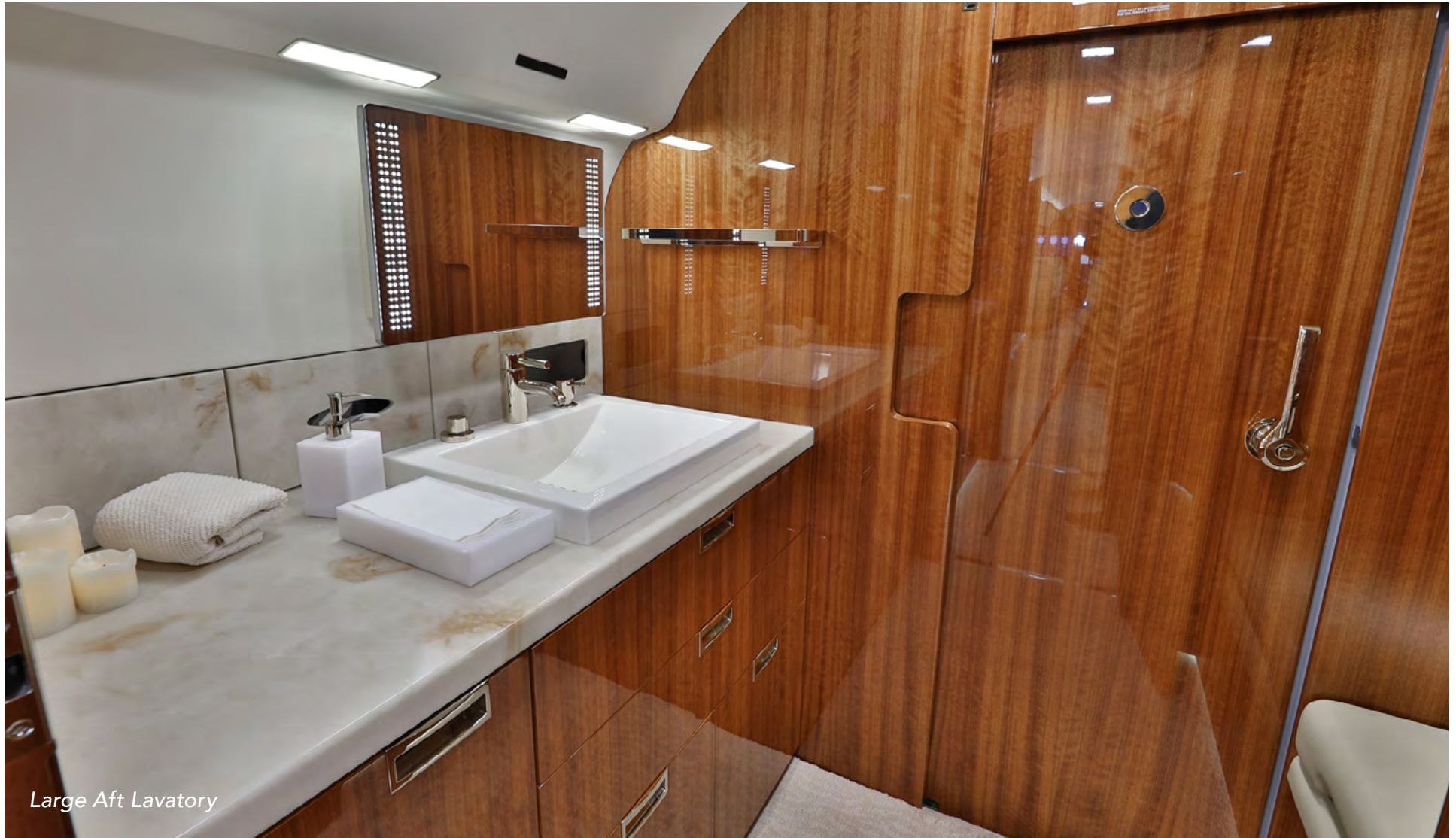
Large Aft Lavatory

Specifications and/or descriptions are provided as introductory information only and do not constitute representations or warranties. Verification of specifications remain the sole responsibility of purchaser. Aircraft is subject to prior sale, lease, and/or removal from the market without prior notice. SPECIFICATIONS AS OF SEPTEMBER 10, 2021.