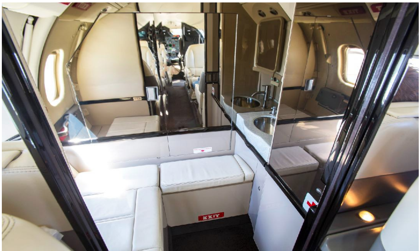
SPECIFICATION SUBJECT TO VERIFICATION UPON INSPECTION. AIRCRAFT OFFERED SUBJECT TO PRIOR SALE OR WITHDRAWAL